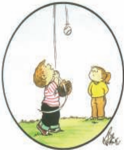
"I'm havin' a catch with God. I throw the ball up, and He throws it back."

There was a very gracious lady who was mailing an old family Bible to her brother in another part of the country.. "Is there anything breakable in here?," asked the postal clerk. "Only the Ten Commandments.", answered the lady.