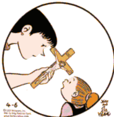
"I liked seeing Jesus in the manger better."

*Captain **Alternate **Should be available by the door until just after service starts