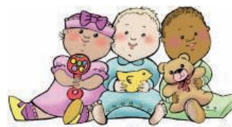
Births in the Church Family